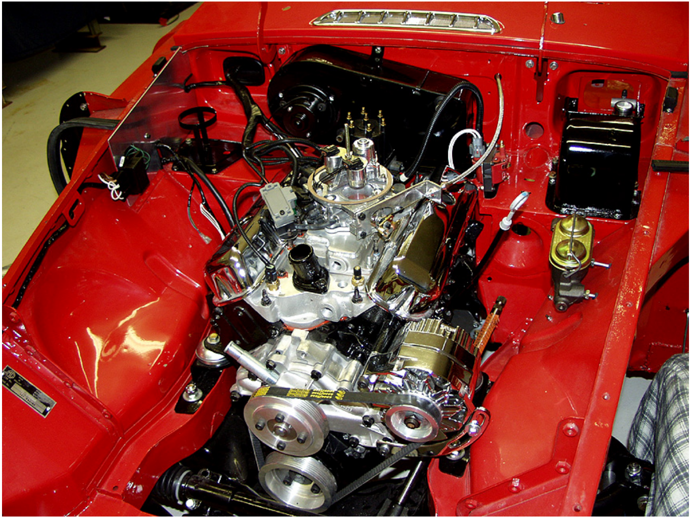
DEAD TRIGGER 2 v1.5.3 Mod Apk